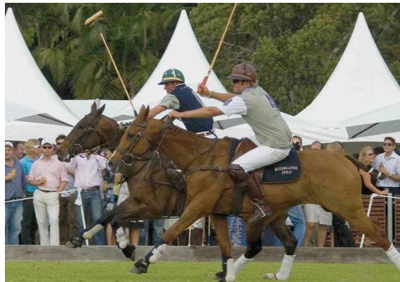
“POLO IN THE CITY” IS A HIGHLY COMPETITIVE TOURNAMENT