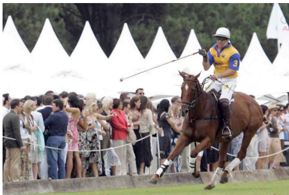
POLO ACTION – “THE GAME OF KINGS”