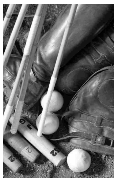
PLAYERS & EQUIPMENT